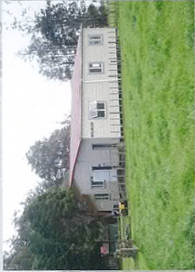
Camp Gow State Highway 27