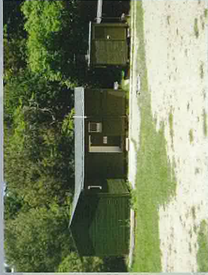
Mc Neils Hut State Highway 24