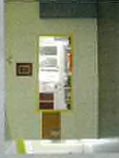
Large Dining room